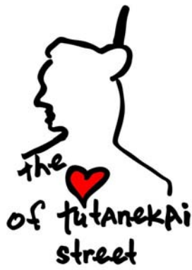
Artist Impression of Rotorua Night Market